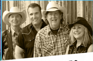
3 CHORD RODEO